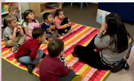
Literacy Week 2023—ELC Guest

worked to build a cohesive program to support a growing population of English Language Learners. She also developed a family involvement program that focused on keeping students engaged in learning outside the school day by working with local businesses and families. Her work with teachers continuously focused on professional collaboration around teaching and learning and creating cohesive teams increasing