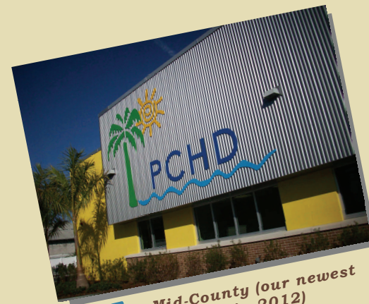
Mid-County (our newest location in 2012)